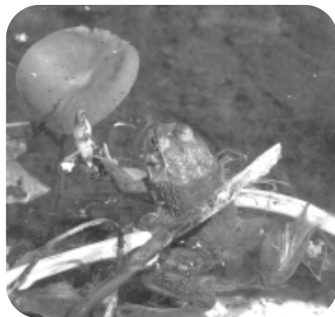
Frog basking in the sun.