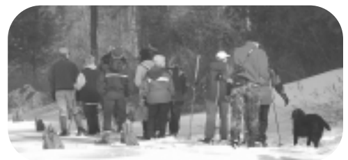
Snowshoers in the Tuthill Woodlands Preserve.

* denotes extra contribution ** denotes contribution of $100 or more