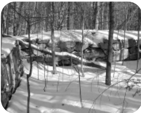
Old cellar hole at Tuthill Woodlands Preserve.

All new members will be entered into a raffle for a night at the Greenfield Inn.