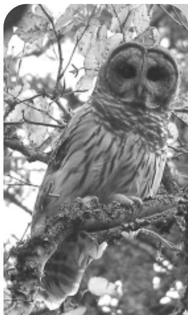
Barred Owl