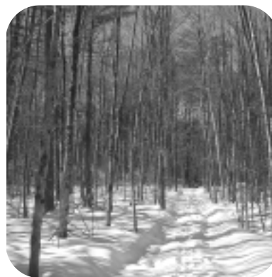
Old road leading into Tuthill Woodlands Preserve.

work to be laid for the Lake Horace Marsh restoration project in Weare, expansion of the website, and...well, probably spaghetti for the Annual Meeting in October. Your questions, ideas, comments, and help are always welcome. As ever, thank you for your support of the PWA.